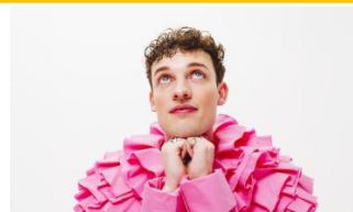
Switzerland Nemo - The Code